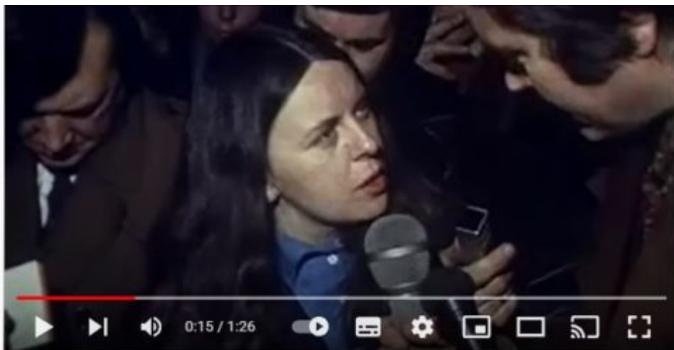
Bernadette Devlin delivers a proletarian protest (31/01/1972)

Bernadette Devlin delivers a proletarian protest (31/01/1972) – YouTube