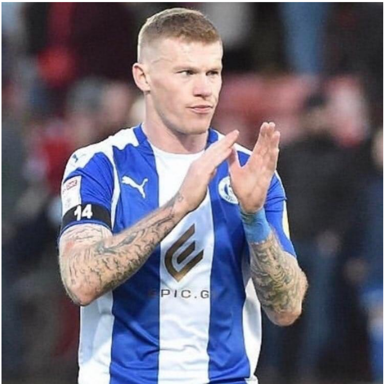
Derry Bloody Sunday March 2022; Irish Soccer Player from