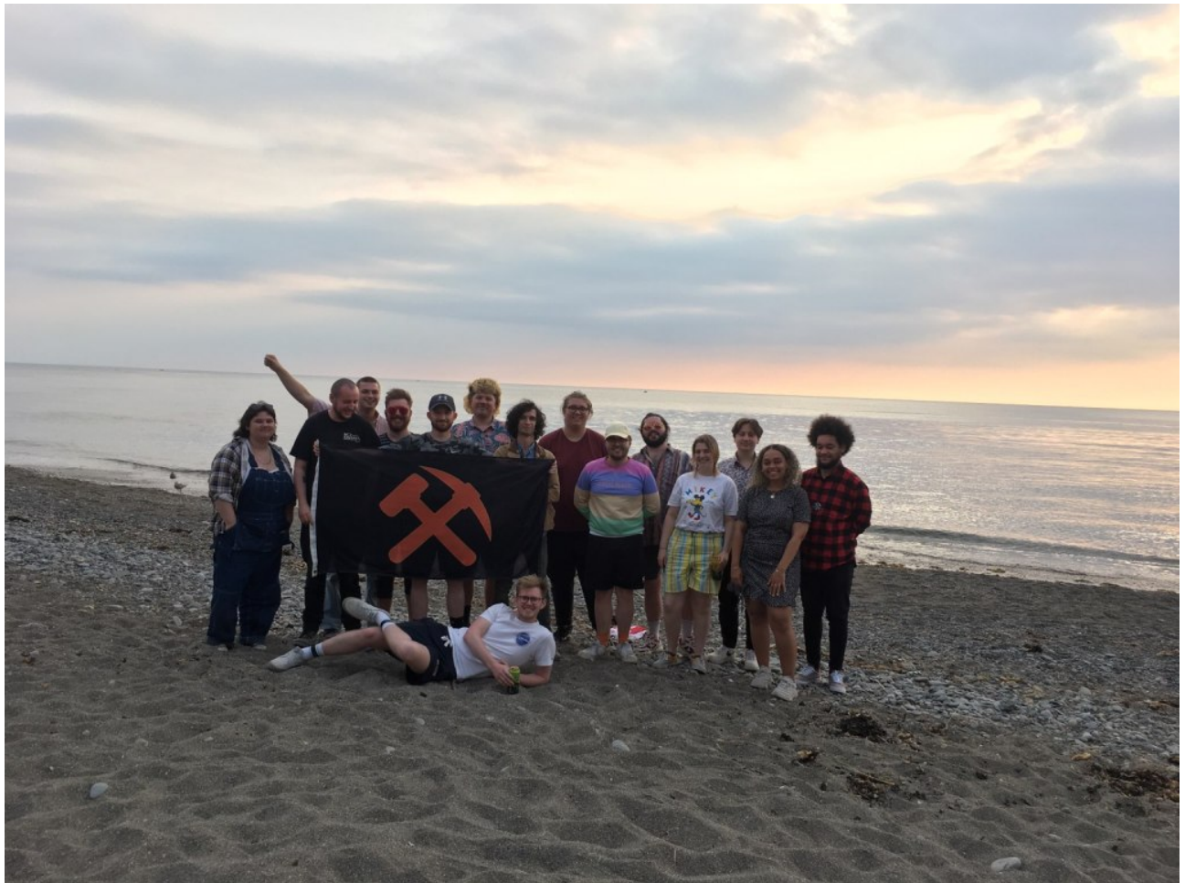
Members at our first-ever WUN Congress in Aberystwyth.