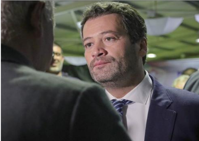
Andre Ventura