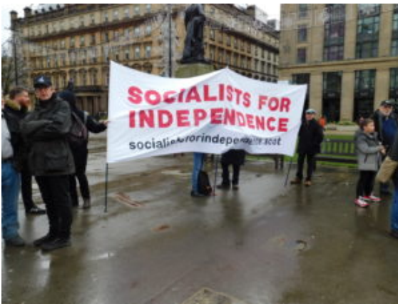
The pro independence movement supported the protest.