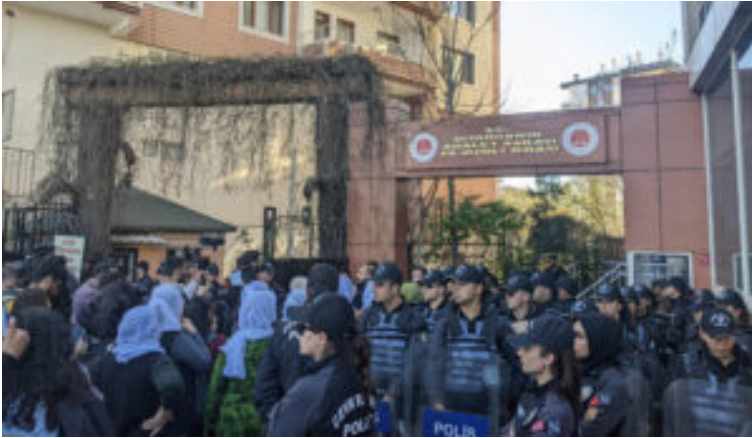
Vigil for forced disappearances