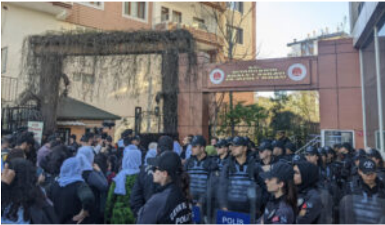
Vigil for forced disappearances