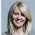
Rt Hon Esther McVey MP