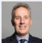
Ian Paisley MP