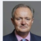
The Earl of Leicester