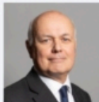
Sir Iain Duncan Smith MP