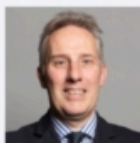
Ian Paisley MP