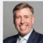
Sir Graham Brady MP