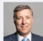
Paul Givan MP

The APPG group has some interesting backers. As Byline Times reported the group is “being funded and managed by Collateral Global – the successor organisation to the ‘Great Barrington