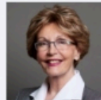
Baroness Foster of Otford