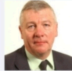
Graham Stringer MP