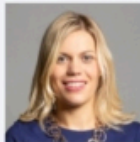
Miriam Cates MP