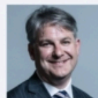
Philip Davies MP