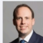
Greg Smith MP