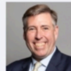
Sir Graham Brady MP