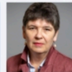
Baroness Fox of Buckley