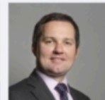
Chris Green MP