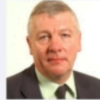
Graham Stringer MP