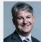
Philip Davies MP