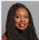
Dawn Butler MP