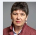
Baroness Fox of Buckley