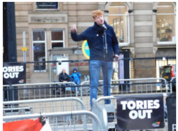
Fridays for the Future Speaker talked about saving the planet.