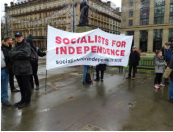
The pro independence movement supported the protest.