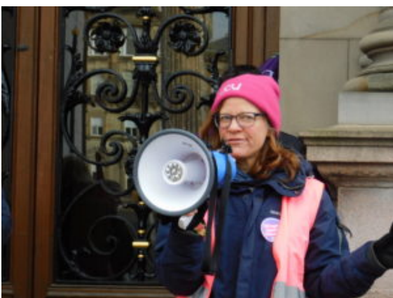
Striking UCU workers at Strathclyde University address Glasgow Council protests