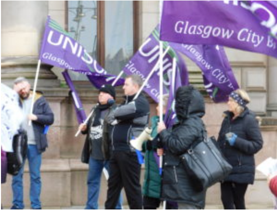
Glasgow City Unison members are among those being balloted for industrial action over equal pay