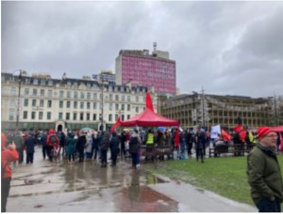
The rain did not dampen spirits