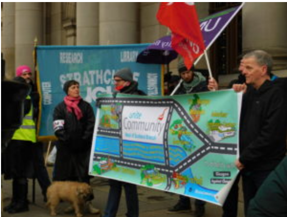
Unite members join forces with UCU strikers in Glasgow