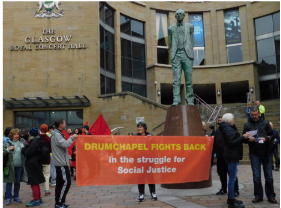
Drumchapel residents protest under the watchful eye of Donald Dewar

supporters is very much welcome, we should beware the Scottish Labour Party leadership's record of empty rhetoric against the SNP – savage cuts were also implemented during periods of Labour control of councils and the UK and Scottish governments and Labour's support for the union saddles Scotland with Tory governments it has never voted for.