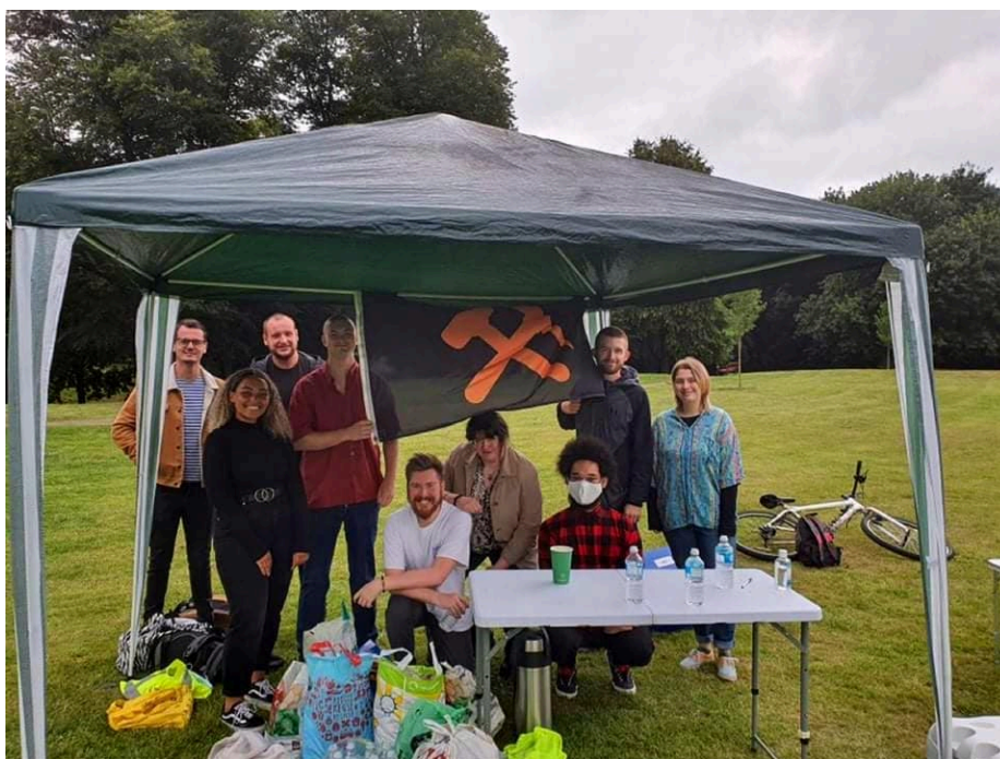
Members of our Wrexham Chapter conducting a free-food event.

From Wrexham City Center, to the Gurnos Shops in Merthyr, Blackwood, Swansea, Lansbury Park, and the Fernhill Estate, our Members have been active across Wales – providing hot food, hygiene products, and basic supplies to those who need them.